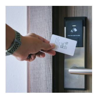
$5,500 Hotel Key Cards

Attendees who stay at the conference hotel will see your company's logo printed on their hotel room key cards. Your company name will be the first thing they see as they head out in the morning and the last thing they see as they turn in for the night.